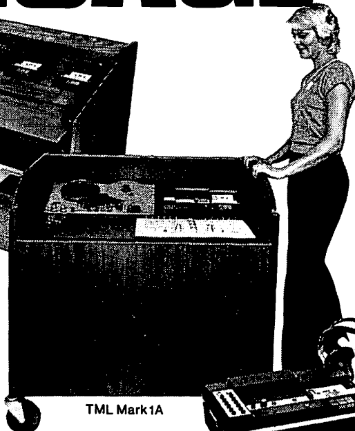
TML Mark 1A

Europe: Le Bonaparte - Office 711, Centre Affaires Paris-Nord, 93153 Le Blanc-Mesnil, France