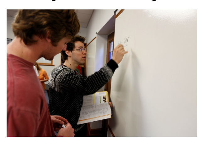
Figure 3. Students writing on writable walls during class.

The plethora of design options and individualizations mentioned in the survey show that the one-size-fits-all approach is slowly disappearing: "We have 3 casual drop in spaces with upholstered furniture; " "Collaborative space for student learning/teaching, regional artist paintings decorate our Center walls, natural light (third floor space);" "Last, not least, plants (foliage and blooming) of every size for decoration and as space dividers!" and "Screen saver collections that pertain to the culture of the languages we study." It is difficult to provide a language center blueprint that fits most schools, and in the design process each case much be individually assessed and planned.