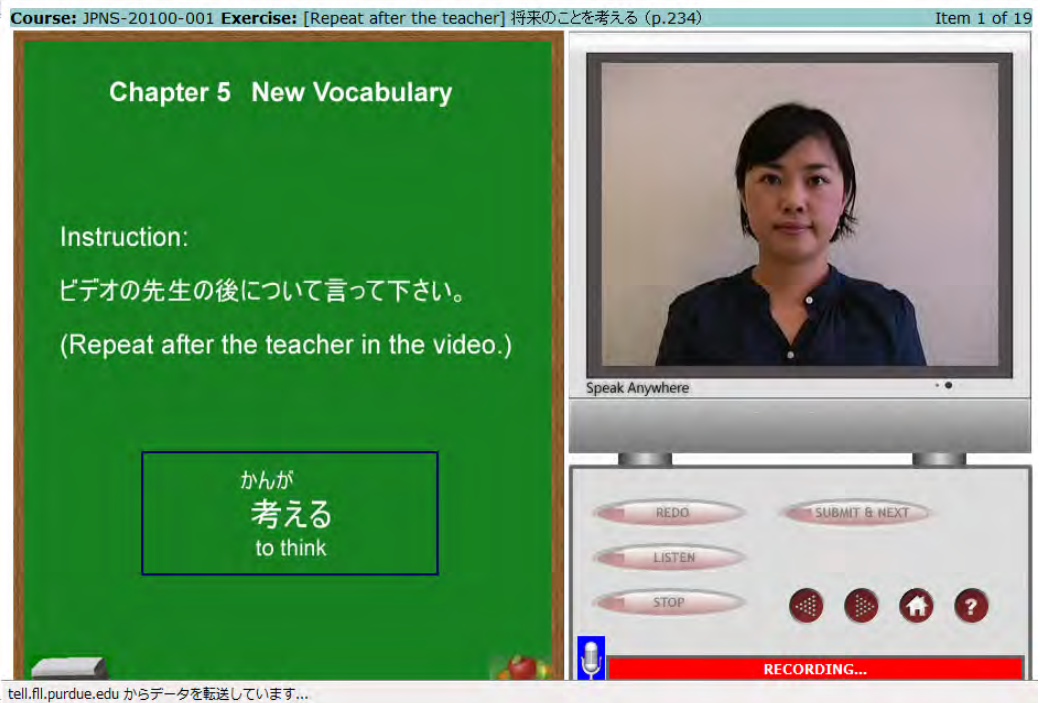
Figure 1. Practice screen

"Redo" once clicked.) When the video finishes playing, audio recording starts automatically. The students are to click "Stop" when finished. The "Listen" button allows them to listen to their recording. Finally, the "Submit & Next" button saves the recording on the server and proceeds to the next vocabulary item. Because the students had used Speak Everywhere for routine oral practice not connected to the present study, they were familiar with the operation of the program.