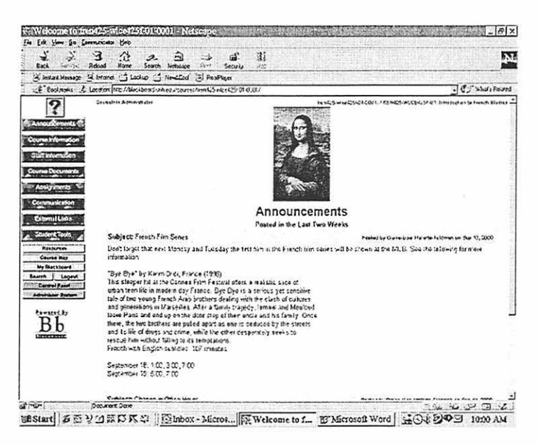
Figure 1 shows a typical Blackboard course home page. The navigation system, located on the left-hand side of the screen,

My first version of Introduction to French Studies was "traditional" in many respects. With an enrollment of over thirty students, it was delivered in a lecture format accompanied by a number of video clips, film excerpts, slide shows and laserdisc presentations. This left very little time for discussion. Throughout the semester, I became increasingly frustrated with not having the technology I needed at my fingertips. We have all experienced the nightmare of failing lamps in slide projectors, jammed videocassettes, or remote controls missing from audiovisual boxes. Time goes so quickly in a classroom setting that any delays or failures in the technology can jeopardize the most carefully organized lesson plan. Needless to say, discussion time is also sacrificed if anything goes wrong during the class. Blackboard provided the help I needed to organize my materials more efficiently for my second attempt at Introduction to French Studies, scheduled for the Fall semester of 1999.